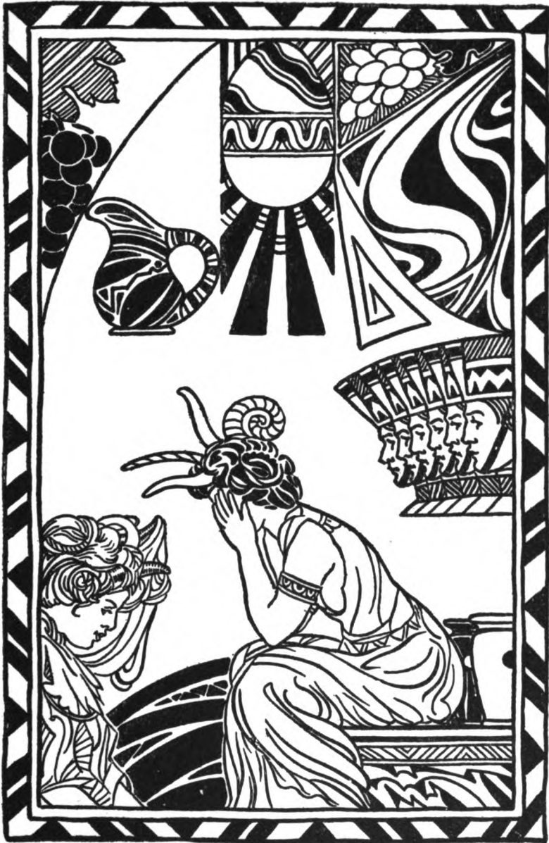
The Magic Pitcher